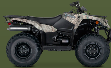
True Timber Kanati

Ideal for riders who favor a sportier performance, this camouflaged KingQuad features a five-speed manual-shift transmission and semi-automatic clutch. This engine is always willing as it cranks out an impressive amount of torque and has an incredibly wide powerband for exceptional performance on the trail or on the job. A long-lasting, high-performance iridium spark plug and refined Pulsed-secondary AIR-injection (PAIR) system help provide outstanding fuel efficiency and impressive performance.